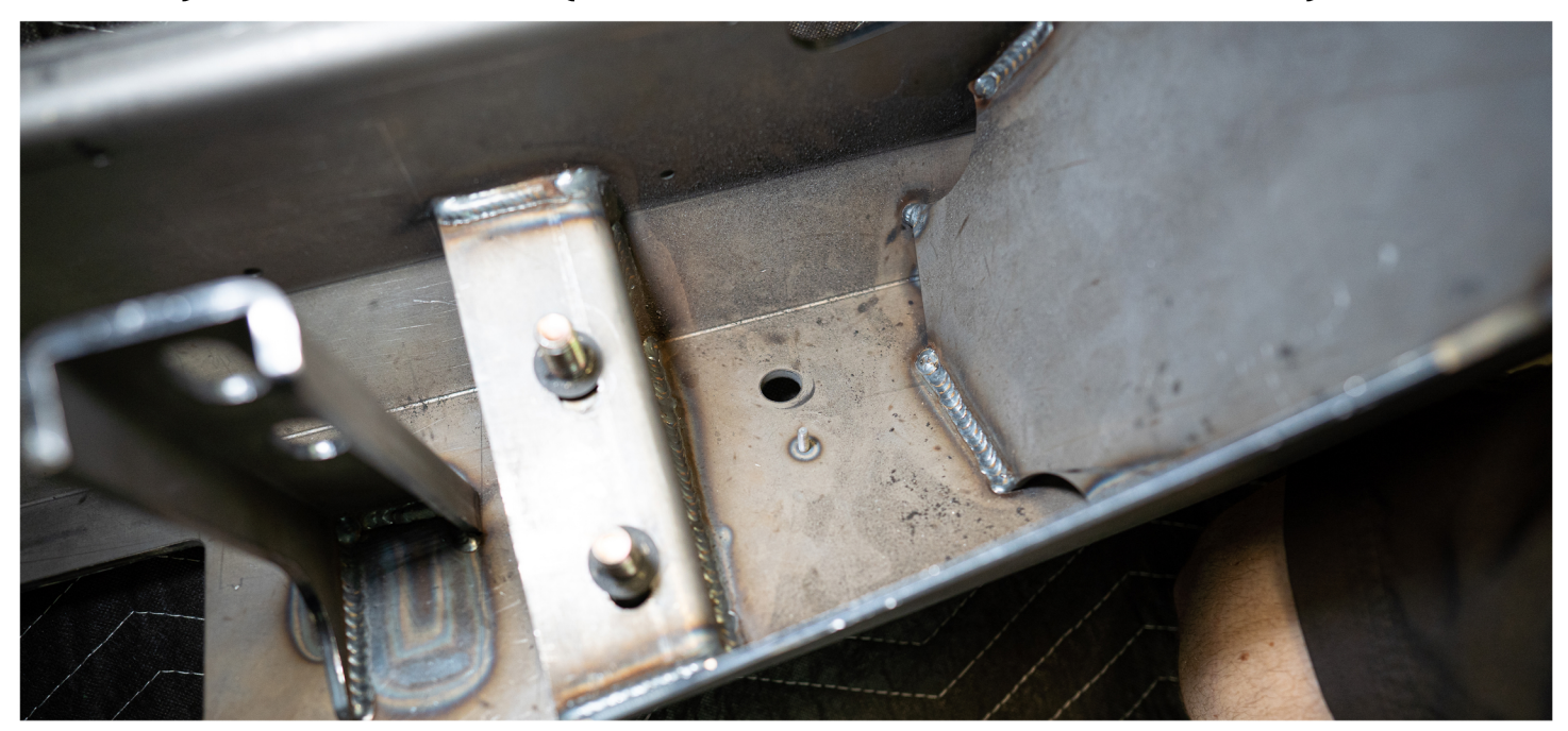
STEP 3: IF YOUR JT GLADIATOR IS EQUIPPED WITH BACK UP SENSORS, ATTACH THE "Z" BRACKETS TO THE 8/32" STUDS USING 8/32" NYLOCK NUTS. INSERT RUBBER BUMPERS ONTO "Z" BRACKETS (ROUND PART FACING THE INSIDE OF THE BUMPER). ATTACH SENSORS (RUBBER PLUG HOLDS SENSOR IN PLACE). SEE PHOTO