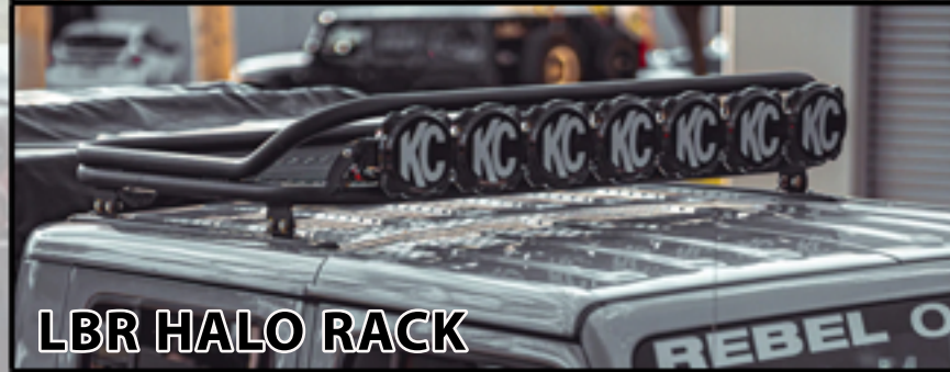
LBR HALO RACK

Our HALO rack is the first of its kind, providing extreme duty cargo management without the need for support bars.