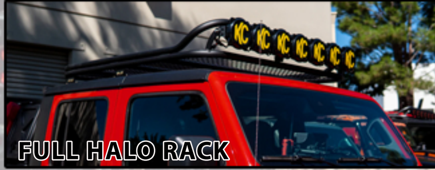
FULL HALO RACK