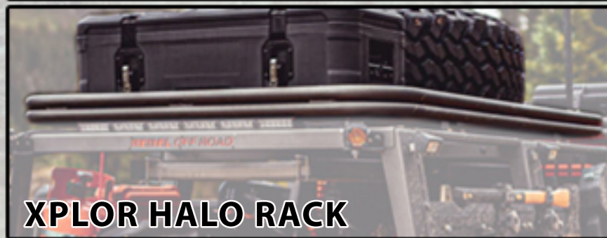
XPLOR HALO RACK

Our bike mounts will attach to your XPLOR side panels, and are fully adjustable to your bikes height & width.